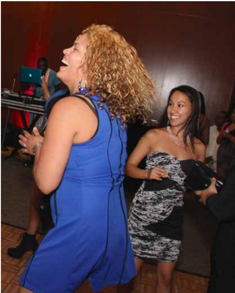
Attendees from the Juneteenth celebration held on June 21, 2014 dance the evening away.

Ann Beha Architects, Inc. Downes Construction Company, LLC The Hartford Steam Boiler Inspection and Insurance Company Hospital for Special Care New England Guild Wealth Advisors Otis Elevator Co-North American Operations/ UTC StanChem, Inc.