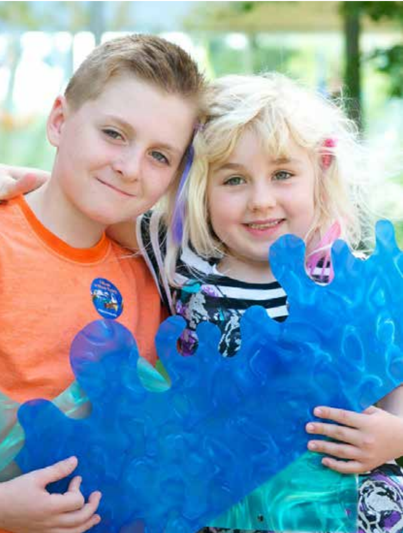
Young participants of the WAVE project, a public art project done in collaboration with Gaffney Elementary School, show off their pieces of the WAVE.

Adult programming throughout the year was strong. Of note was the ambitious programming schedule during the popular exhibition Maurice Sendak . The exhibition, organized by OPAR Media Inc., enticed strong attendance for its variety of programs offered with support from Connecticut