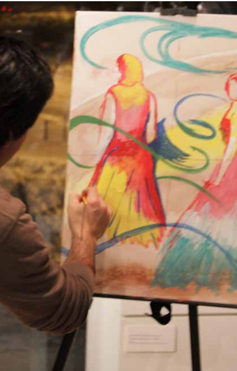
Visitors taking part in First Friday experience live art activities from local artists.