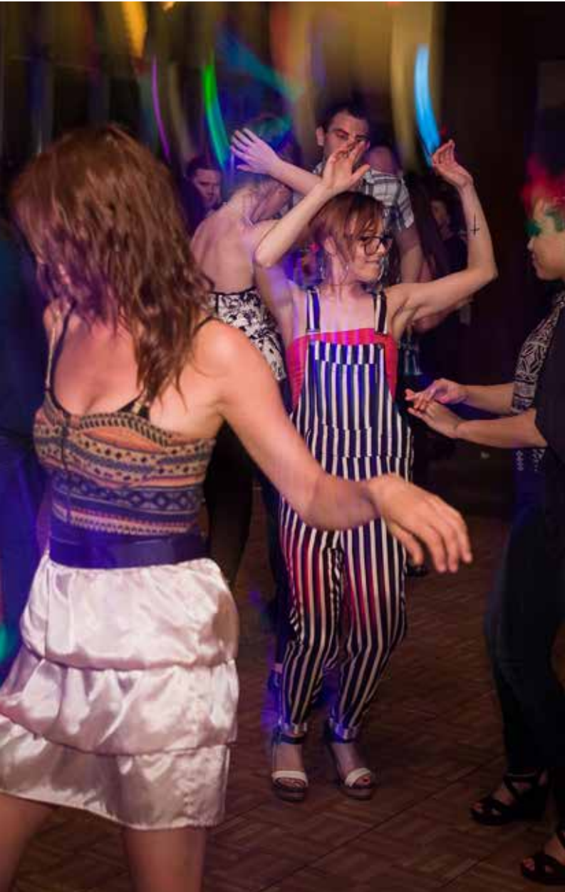
Museum After Dark goers dance the night away at a Camp themed party.