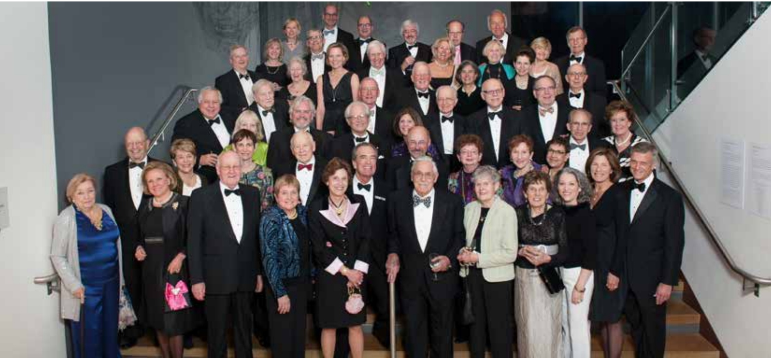
Members of the John Butler Talcott Society at the 2014 Director's Dinner.