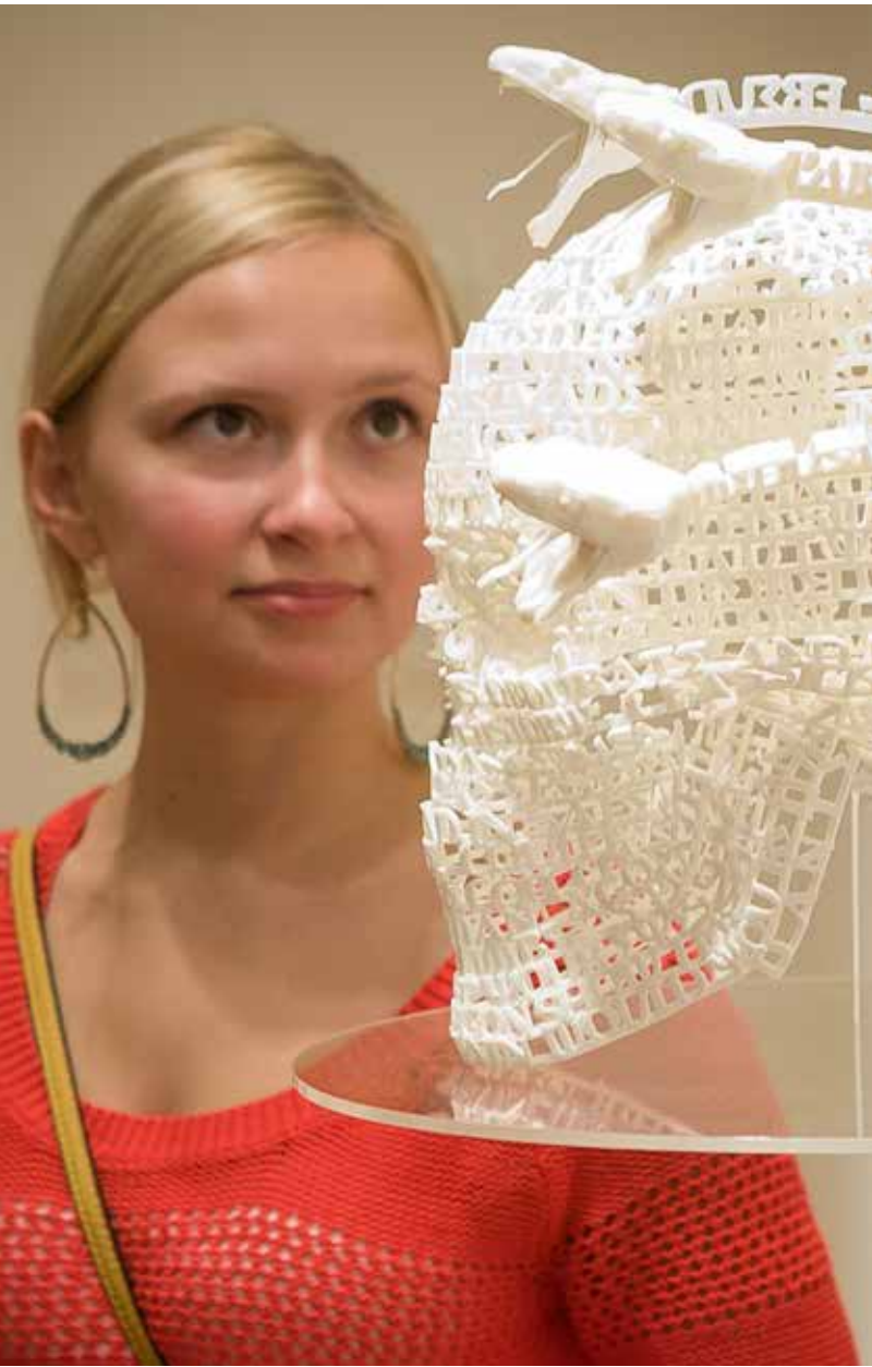
Museum After Dark gives young people who might not regularly attend museums a chance to explore art in a fun environment with their peers.