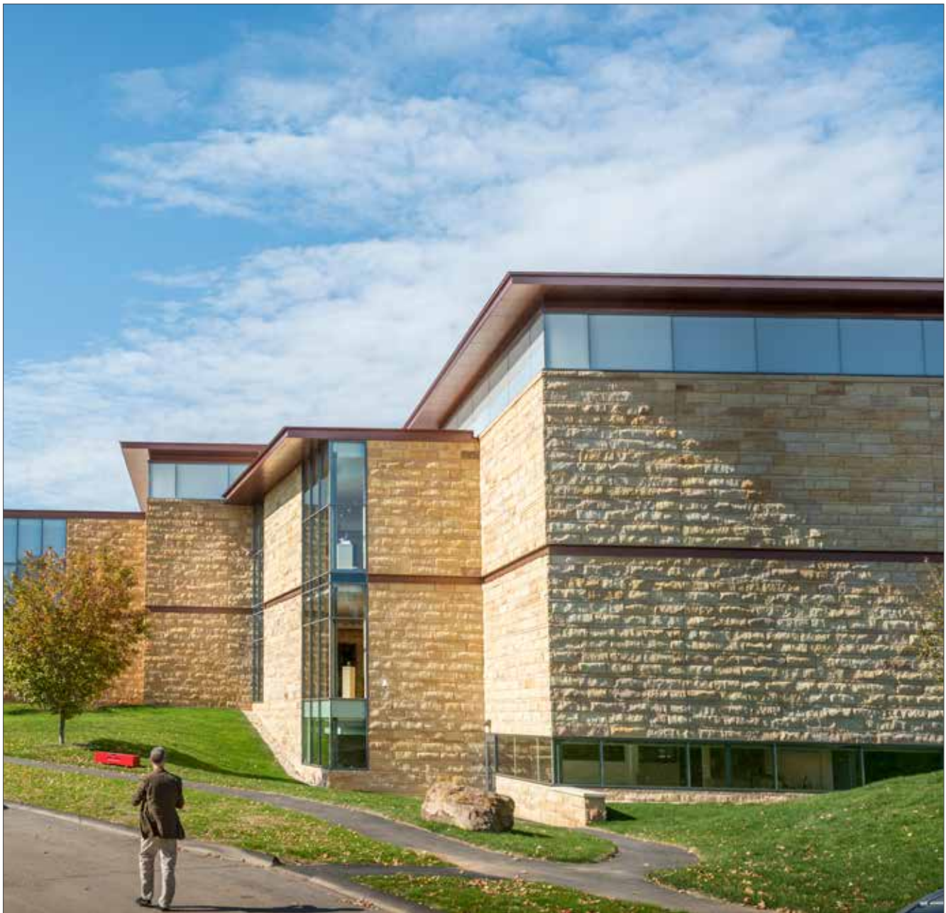
View of the new Art & Education Building from Walnut Hill Park