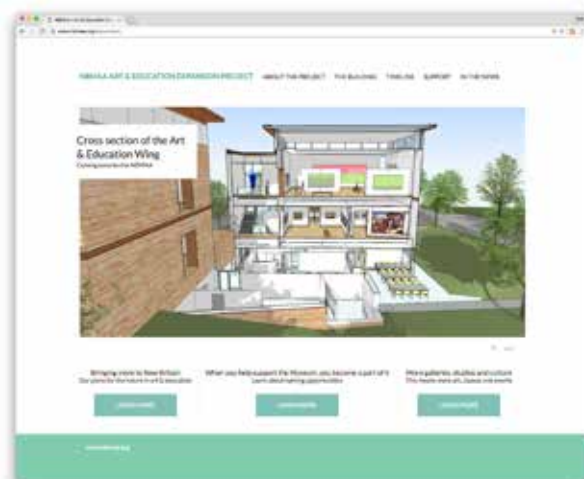
Screenshot of a webpage from the Art & Education Expansion Project sitelet