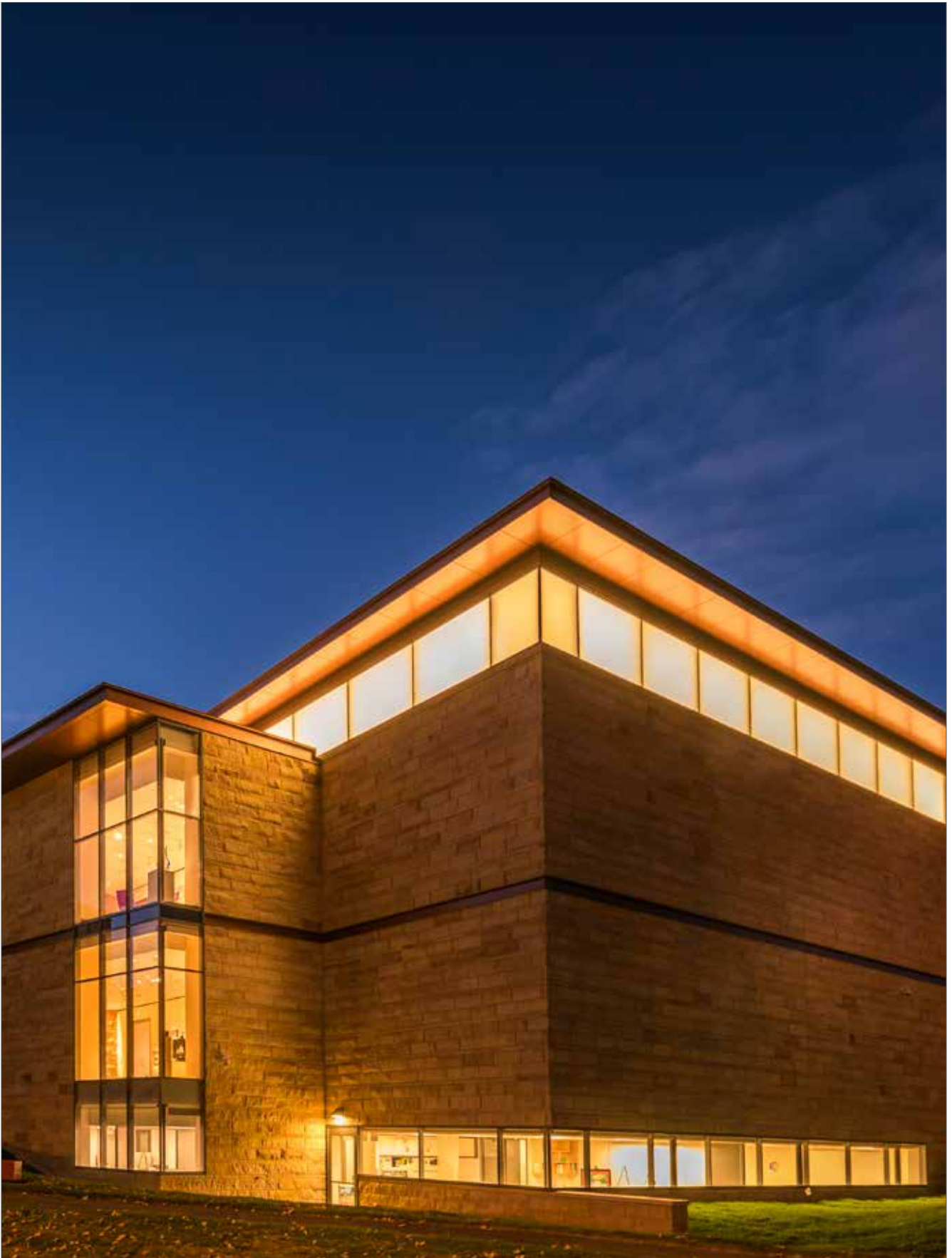
View of the Art & Education Building from Walnut Hill Park