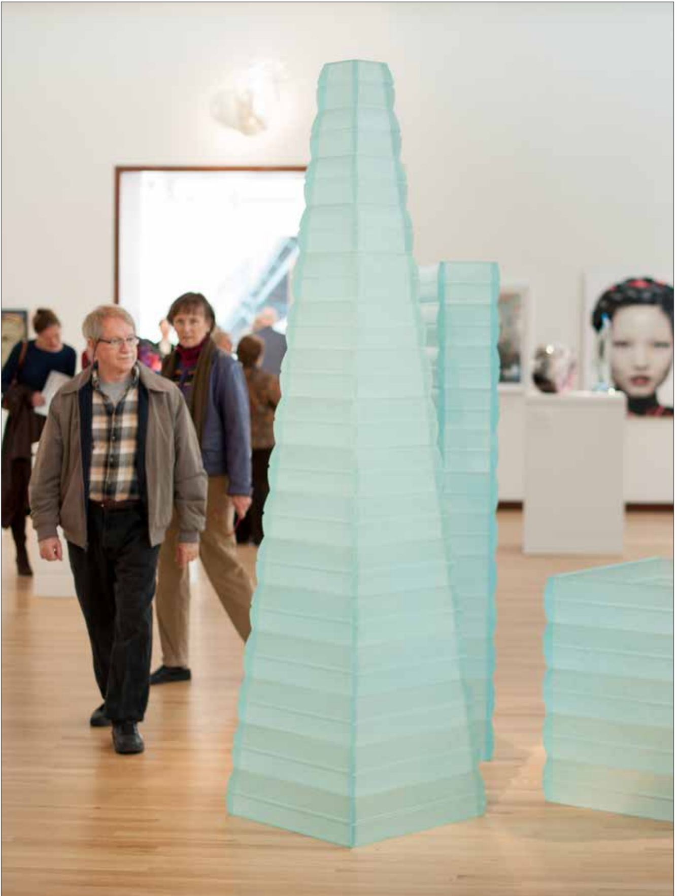
Guests enjoy the Museum's galleries at the Ribbon Cutting Ceremony for the Art & Education Building on October 18, 2015