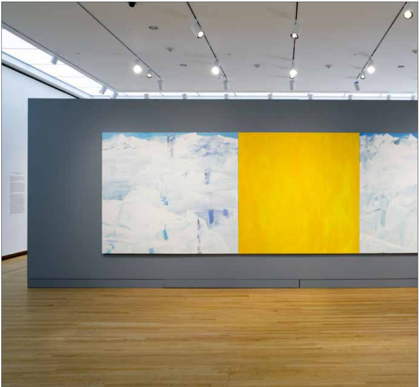
Gallery view of Eric Aho: An Unfinished Point in a Vast Surrounding