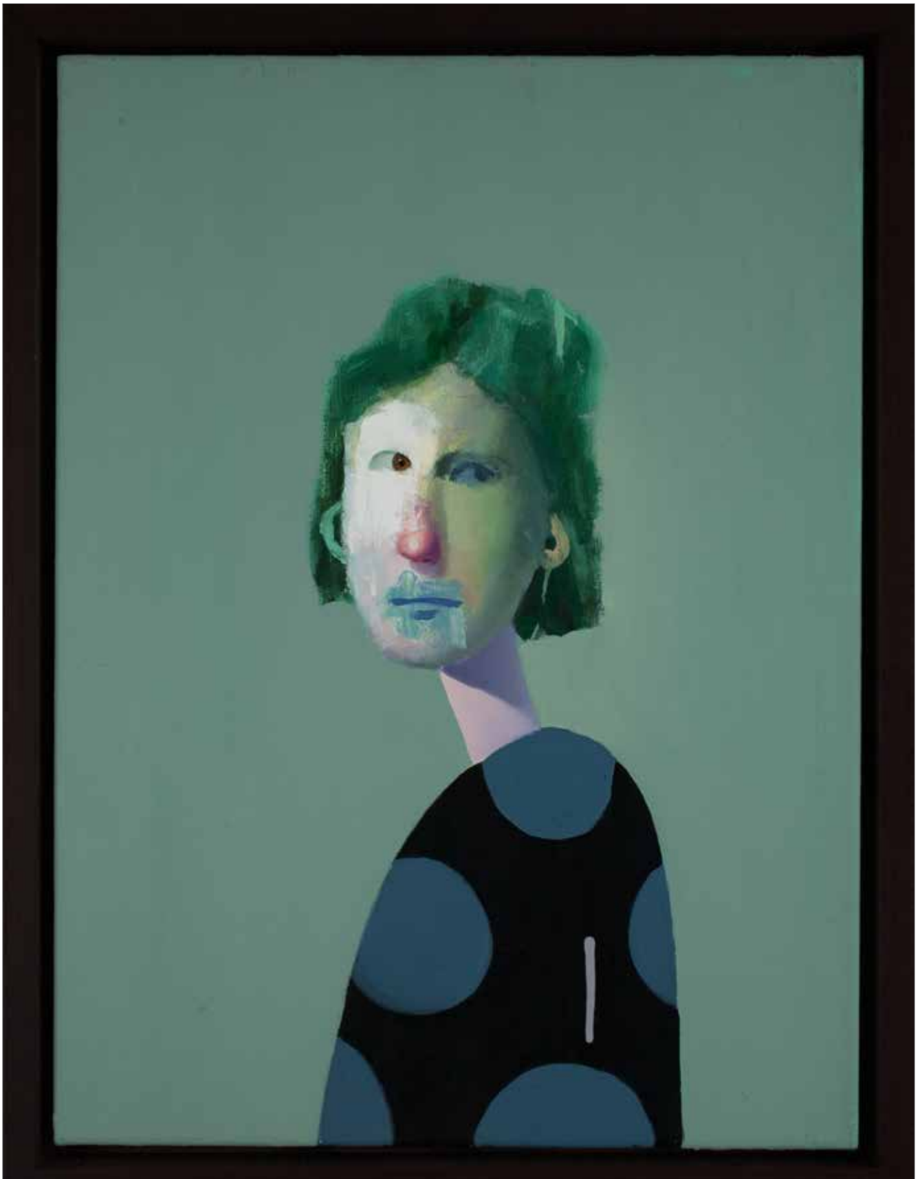
Edward Valentine, Untitled Portrait with Green Painted Hair and Dots , 2011, Oil on canvas, 18 x 24 inches, Anonymous gift, 2015.157