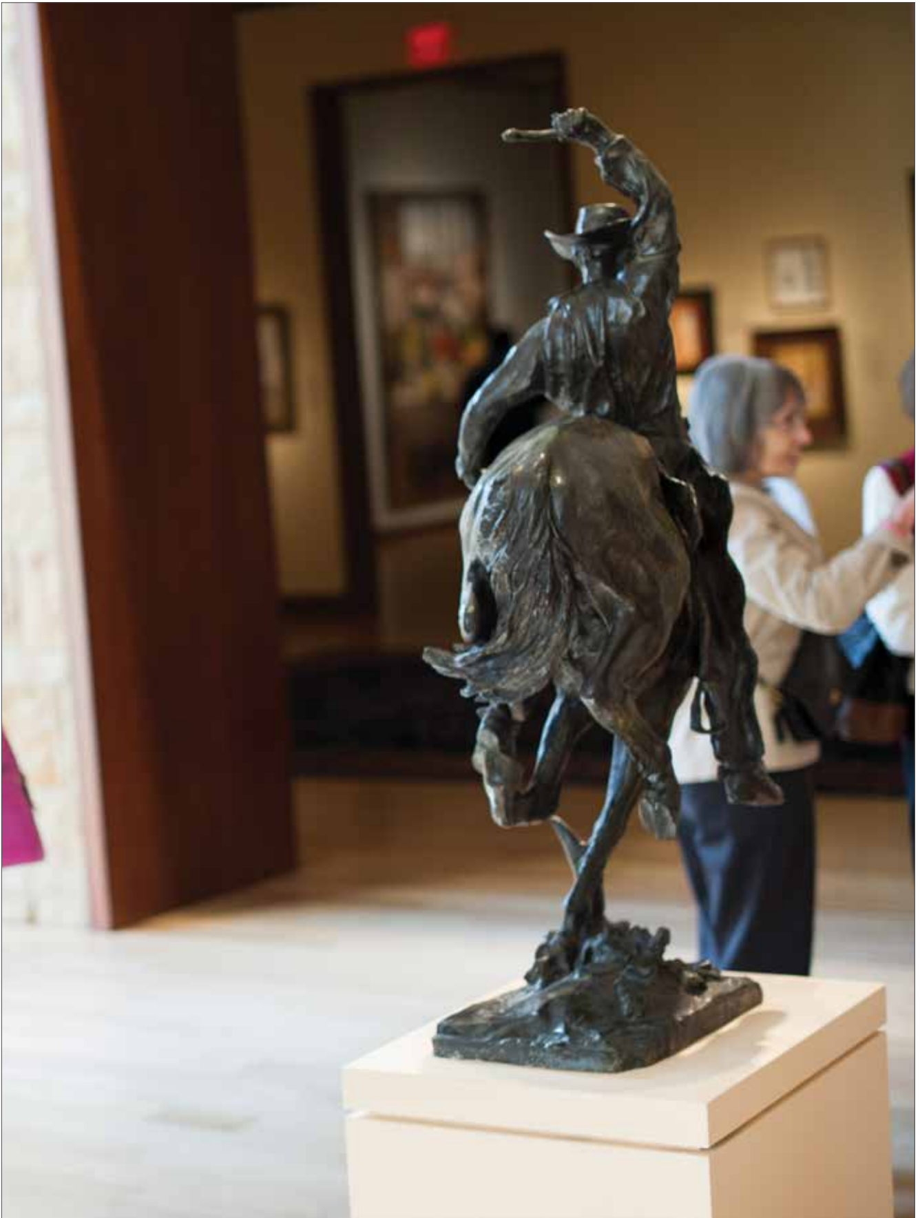
Solon H. Borglum, One in a Thousand , 1901, Bronze, black patina, and applied verdigris, 43 \frac{1}{8} x 26 \frac{3}{4} x 13 \frac{1}{4} inches, Charles F. Smith Fund; in the Douglas K.S. Hyland Gallery