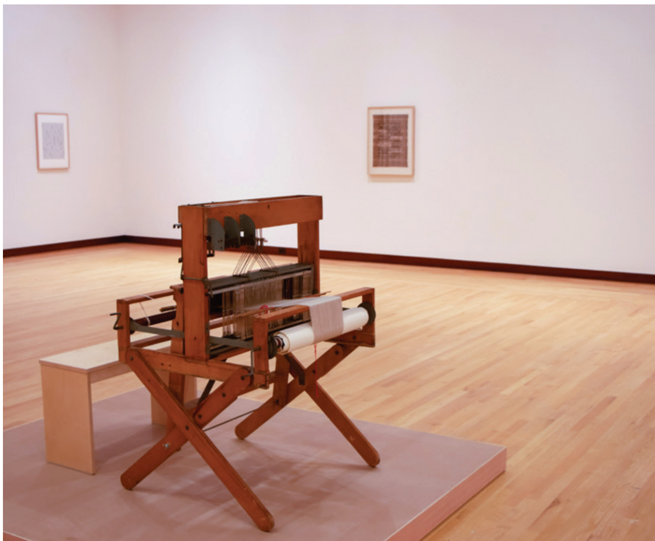
Above: Install shot of Anni Albers's loom.