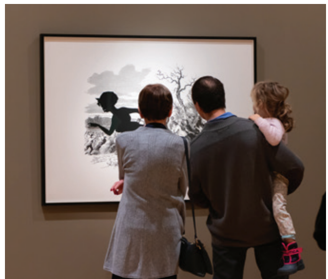
Images of the Members Only Opening Reception for Kara Walker: Harper's Pictorial History of the Civil War (Annotated)