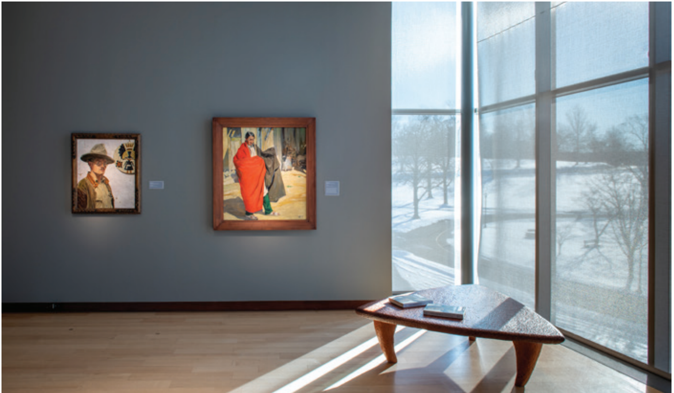
Gallery shot of For America Paintings from the National Academy of Design, 2019