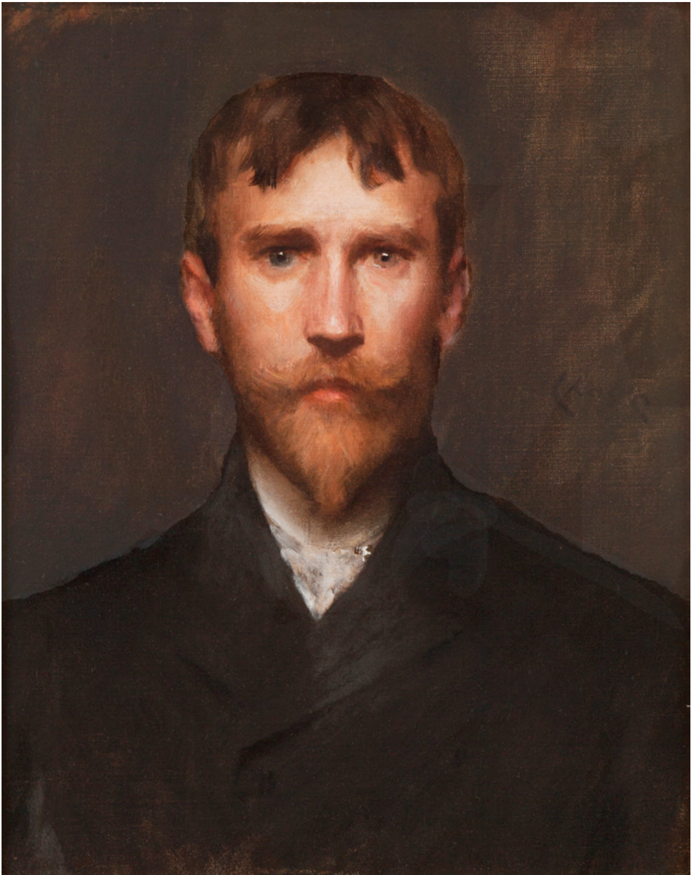
William Merritt Chase, Robert Blum , 1888, Oil on canvas, 21 1 / 8 x 17 1 / 8 in., National Academy of Design, Courtesy American Federation of Arts