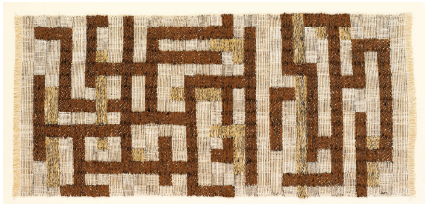
Above: Anni Albers with Black, White, Gold I, ca. 1950–60, | Below: Anni Albers, Two, 1952, Linen, cotton, rayon, 18 1/2 x 40 1/4 in.