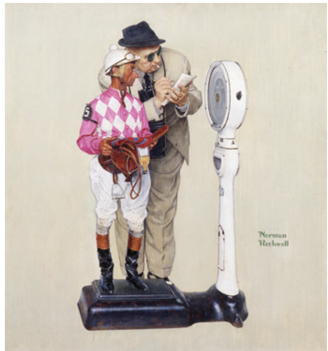
Norman Rockwell (1894–1978), Weighing In , 1958, Oil on canvas, 33 x 30 7 / 8 in., Gift of the artist, 1969.76LIC