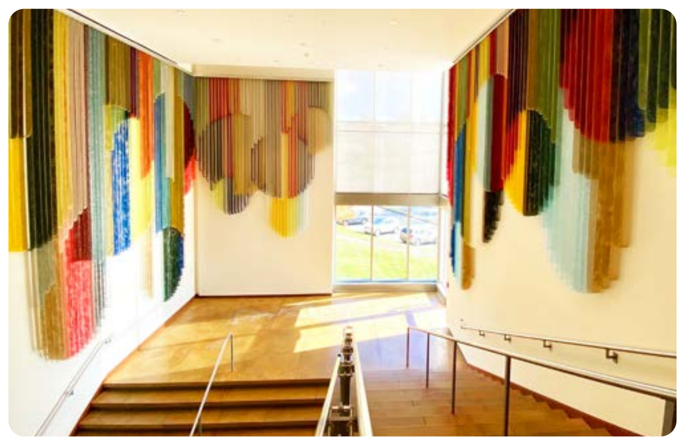
Eva LeWitt, Untitled, 2021, Coated mesh fabric, Howard Fromson Endowment for Emerging Artists, 2021.30

Along the walls of the LeWitt Family Staircase hangs the NBMAA's largest artwork on site: Untitled by Eva LeWitt.