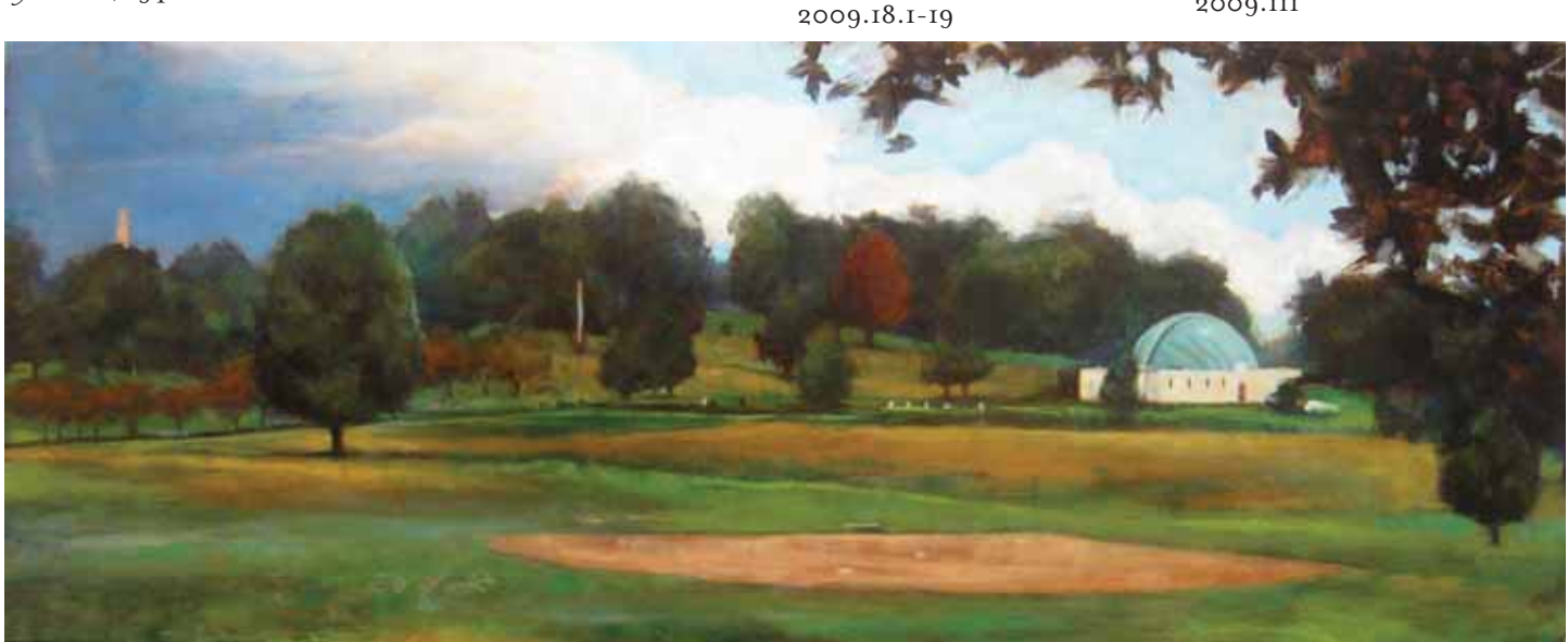
Kyle Andrew Phillips (b. 1986), Walnut Hill Park, 2008, Oil on board, 10 x 26 1/2", 2008.61, Gift of the artist

Color Veil, 1984 Acrylic on canvas, 36 x 31" Gift of the Austin Fairchild Art Foundation 2009.111