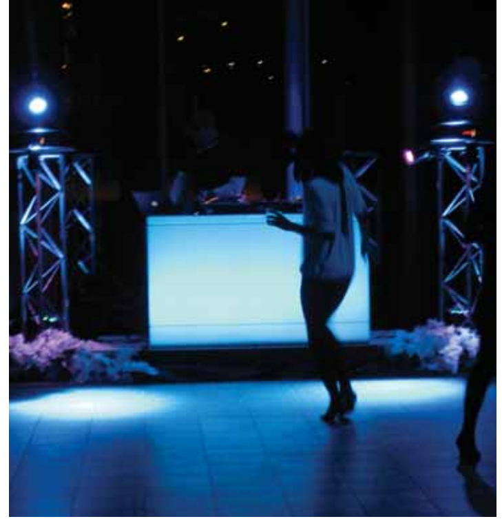
On the dance floor at Museum After Dark

On Saturday, May 2, 2009, 366 guests gathered for the Museum's annual spring fundraising gala – The ART Party of the Year – and what a party it was. According to Krystian von Speidel of the Hartford Advocate,