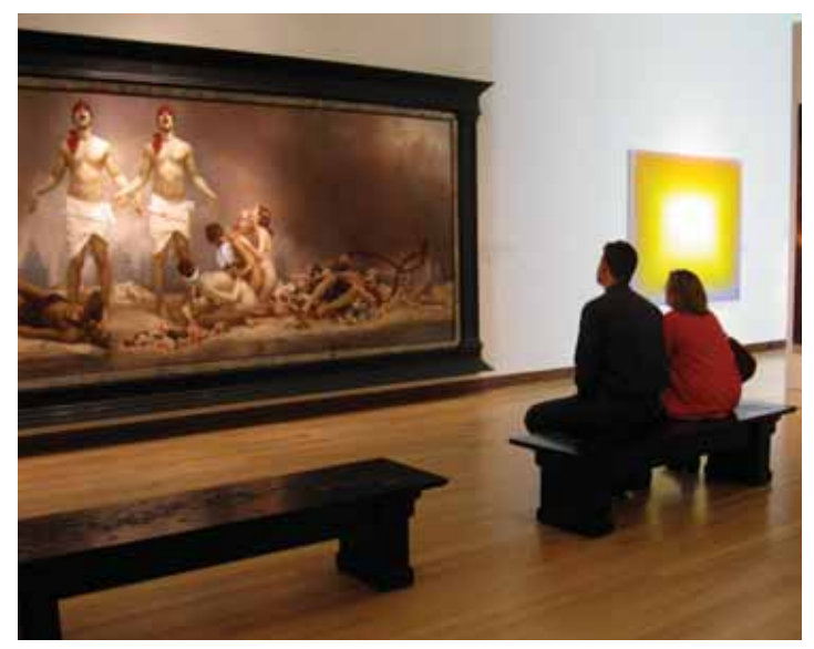
Visitors sit and contemplate Graydon Parrish's allegorical piece The Cycle of Terror and Tragedy, September 11,

The Museum continued its partnership with the internationally-know organization Elderhostel, a notfor-profit organization dedicated to providing educational adventures for people age 55 and over. Elderhostel "Day of Discovery" programs at the Museum includes a brief