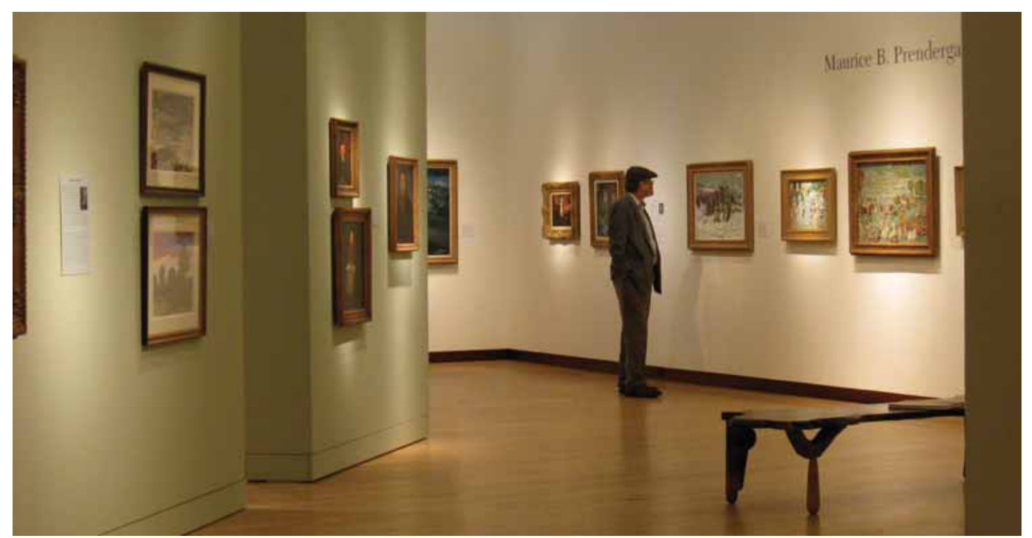
A guest looks over The Eight and American Modernisms at a First Friday