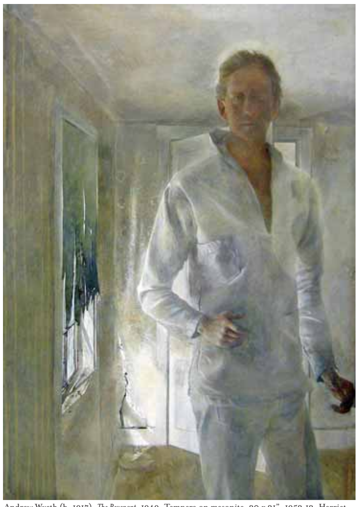
Andrew Wyeth (b. 1917), The Revenant , 1949, Tempera on masonite, 30 x 21", 1952.12, Harriet Russell Stanley Fund

Raphaelle Peale (1774-1825) Bowl of Peaches, 1816 Oil on canvas, 12 ^{5}/_{8} x 19 ^{1}/_{4} " Harriet Russell Stanley Fund 1961.01