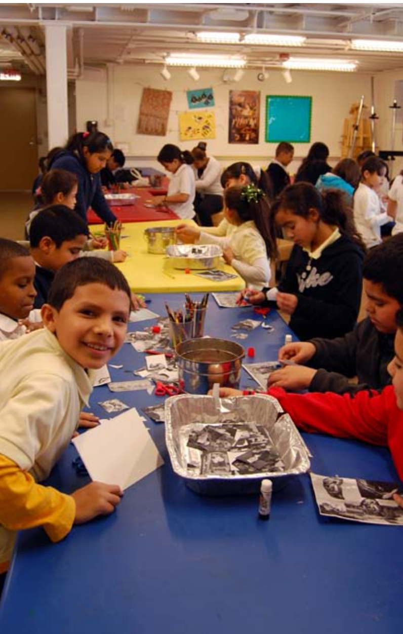
Student tours start with a docent-led tour through our galleries and end in our American Savings Foundation Art Studio where students participate in an arts activity that reflects what they have learned.