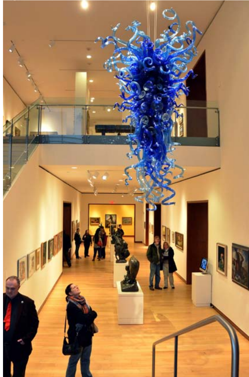
A guest at the UMC: Night at the Museum collaborative event with CCSU admires the Chihuly chandelier hanging in the LeWitt Family Staircase.