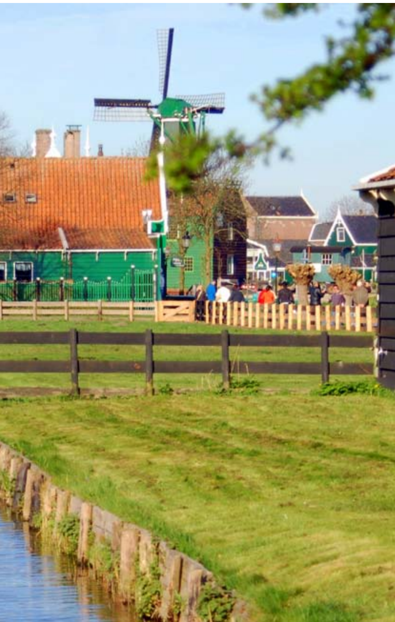
The Zaanse Schans is a windmill park/museum, where decommissioned windmills are sent to pasture, and it was our first stop on the Netherlands barging tour. On the Zaanse River and representational of a typical 17th & 18th-century zaanse village, it features stylized houses, shops and windmills!