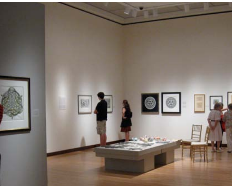
A corner of the M.C. Escher exhibition featured a children's table with Escher games and puzzles.