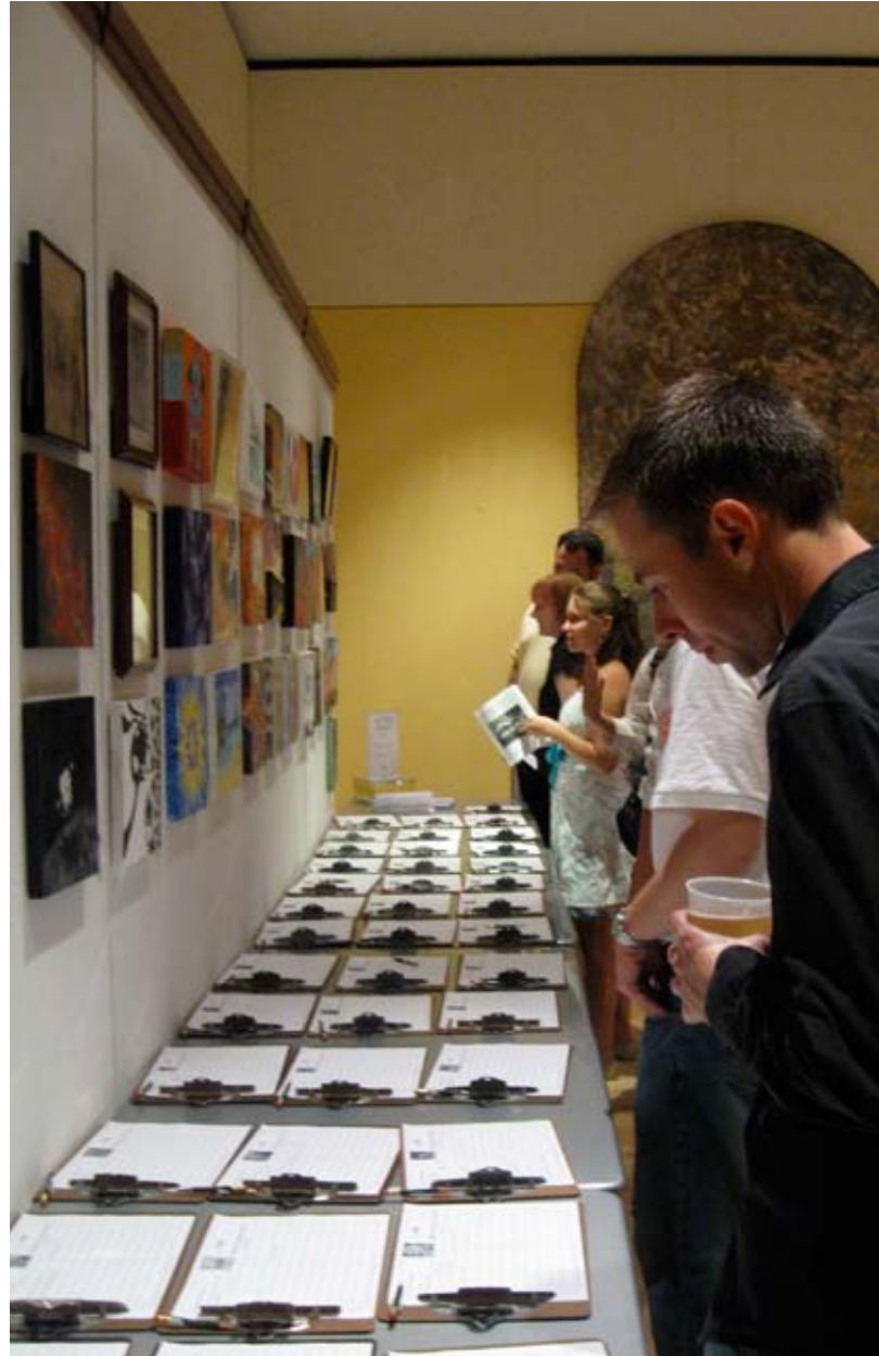
Guests check out auction items at Museum After Dark's Annual Summer Art Auction, August 20, 2010. Dozens of ten by ten inch canvasses were up for bid.