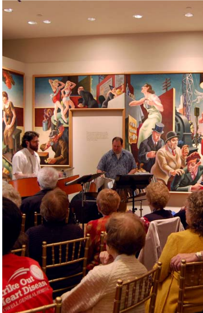
Community Day April 10, 2011 featured Caribbean sounds from Harmony of Steel presented by the New Britain Symphony Orchestra.